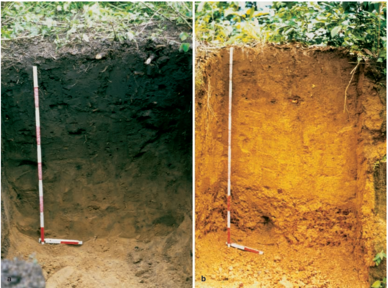
Fig. 1 Typical profiles of 'Terra Preta' (a) and Oxisol (b) sites

matic carbon in soil is black carbon (Haumaier and Zech 1995; Skjemstad et al. 1996; Golchin et al. 1997; Schmidt et al. 1999; Schmidt and Noack 2000), which is a major component in the residues of charred plant material (Glaser et al. 1998).